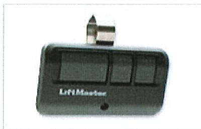
3-button Remote Control w/MyQ Technology