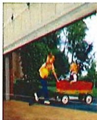
The Protector System