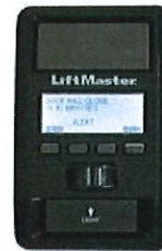
Smart Control Panel w/Timer-To-Close

Model 8355 -- 1/2 HP Belt Drive. Quiet operation and energy efficient.