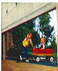
The Protector System