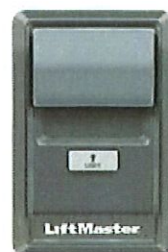
Multi-Function Control Panel

Model 8587 -- 3/4 HP chain drive opener for the heaviest garage doors.