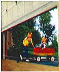
The Protector System