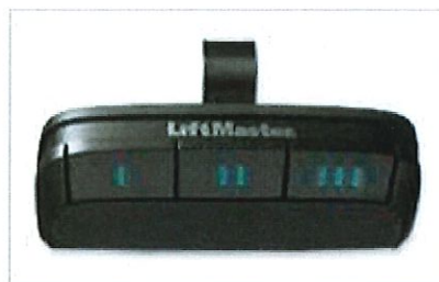
Three-button Elite Remote Control w/MyQ Technology