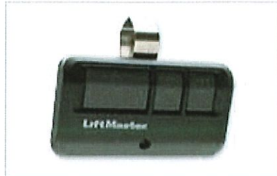
3-button Remote Control; MyQ compatible