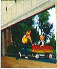
The Protector System