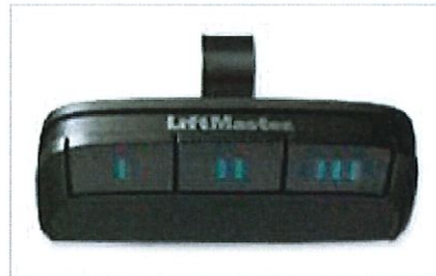
3-button Premium Remote Control w/MyQ