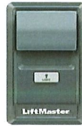
Multi-Function Control Panel

Chain Drive Openers -- LiftMaster offers the widest variety of chain drive garage door openers available on the market. They are durable, reliable, and offer lasting performance.