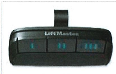
3-button Elite Remote w/MyQ Technology