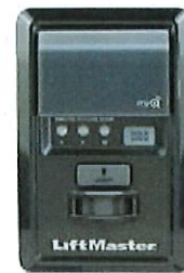
MyQ Control Panel