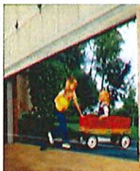
The Protector System