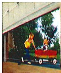
The Protector System