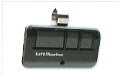
3-button Remote Control w/MyQ Technology