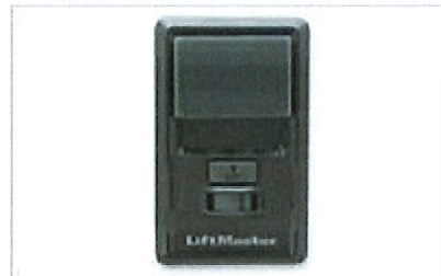
Motion Detecting Control Panel