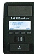
Smart Control Panel w/Timer-To-Close