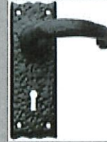
Handle with Keyhole