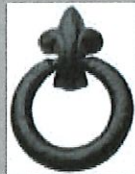
Ring Door Knocker