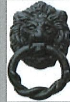
Lion's Head Door Knocker