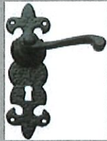
Fleur de Lis Handle