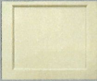
Recessed - Short

Model 20 -- Available in paint or stain grade